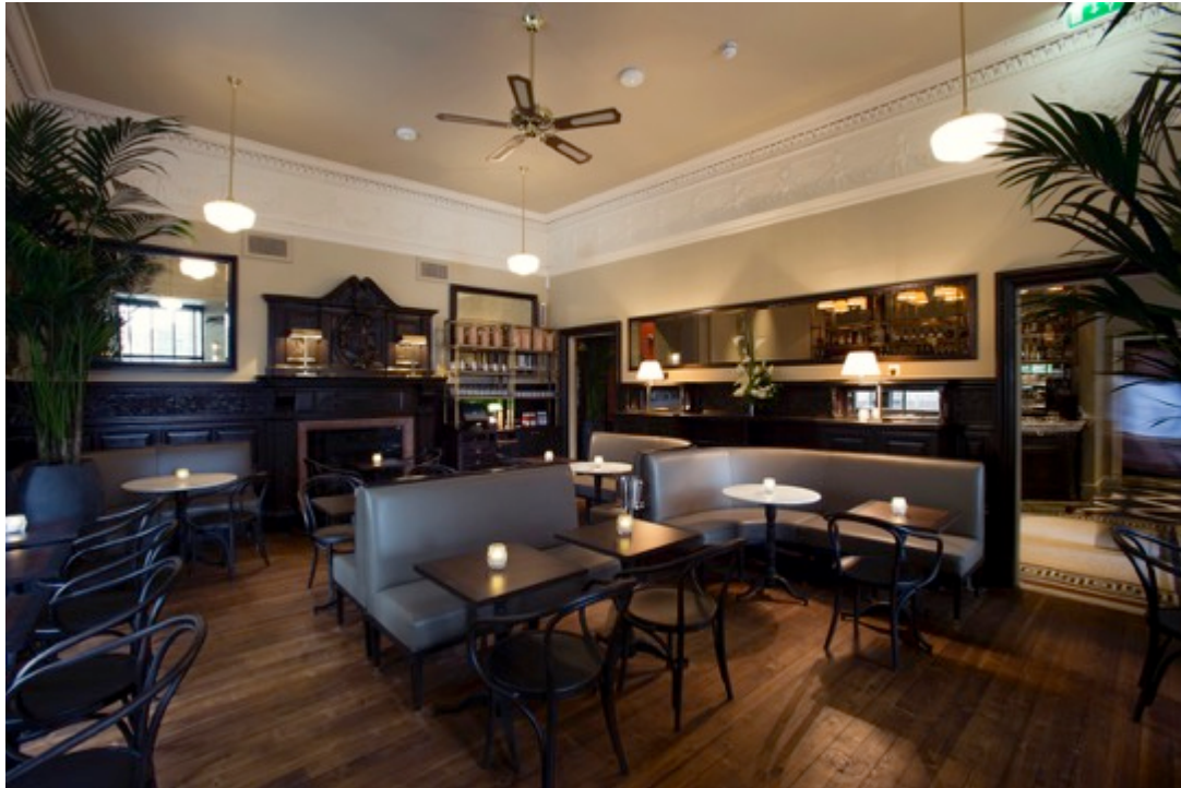
The seated area of The 158 Café Bar