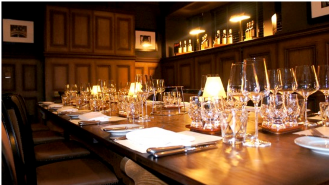
Glenfarclas Private Dining Room