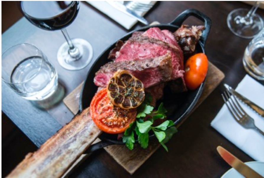
A 1.2kg Tomahawk Steak Sharer in our Grand Brasserie

We use only the very best Scottish produce and are proud members of The Scotch Beef Club and Visit Scotland's Taste Our Best quality assurance scheme award which recognises businesses that are passionate about providing a quality dining experience. By working hard with all of our suppliers we ensure the quality, provenance and traceability of all the ingredients we use.