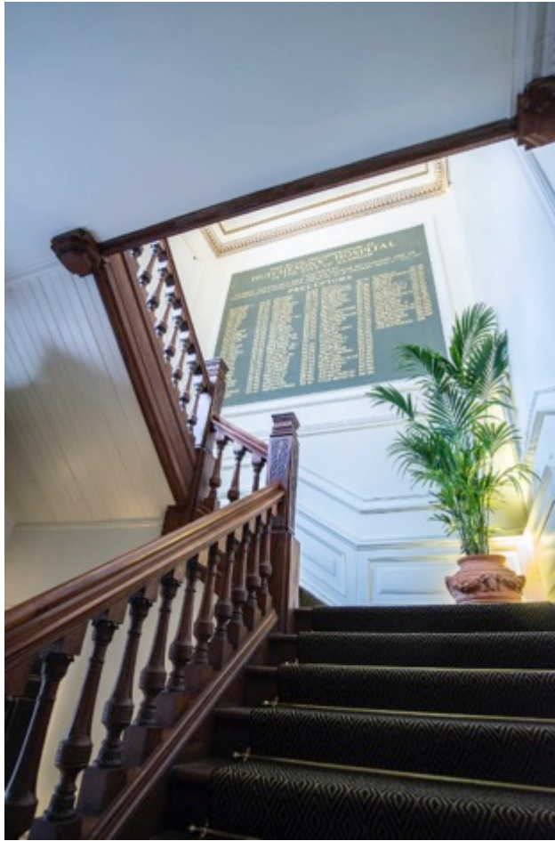
Stairway to our Grand Brasserie