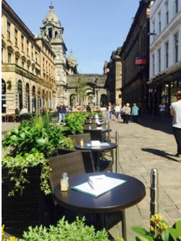
Outside Terrace at Hutchesons