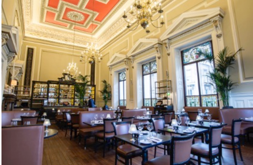
Grand Brasserie Restaurant at Hutchesons

Hutchesons features one of the most exquisite double-height ceiling rooms in Glasgow that's located on the second floor, and can be accessed via the lift or our original stairs which have a wooden bannister.