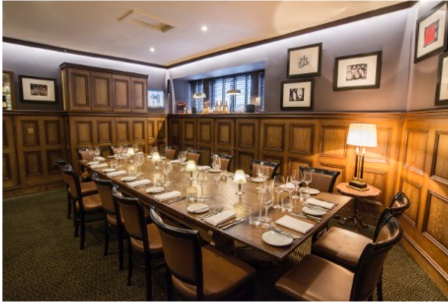
Glenfarclas Private Dining Room