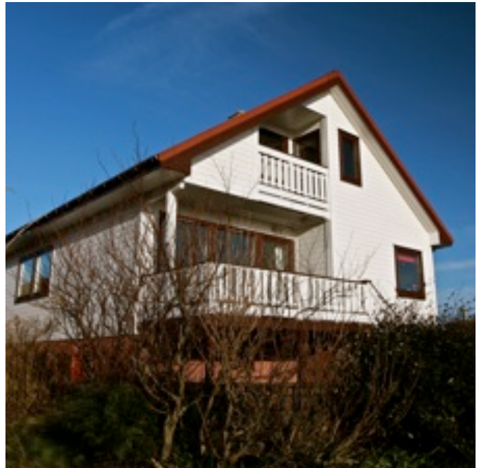
View of the house from the garden.

This modern two-storey house is situated in a quiet cul-de-sac in the rural village of Sandwick, mid way between Lerwick and Sumburgh airport. It offers superb self-catering facilities with bedroom accommodation to sleep five persons.