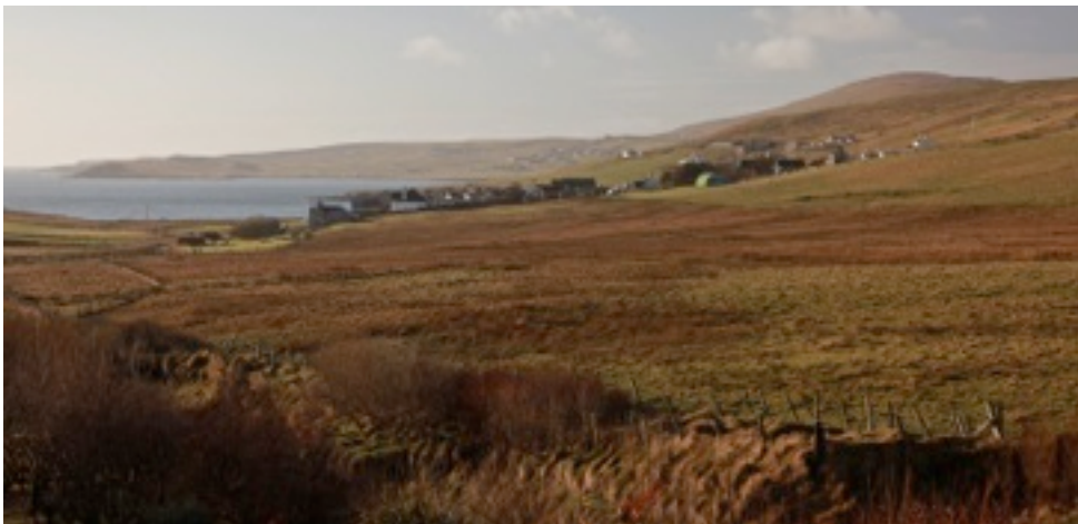
View from the upper balcony

The house stands in an attractive garden packed with trees, bushes, flowers and birds. There is a “wendy” house in the garden, and a private drive that can accommodate up to three cars. There are beautiful unobstructed views from the balcony off the main bedroom upstairs, as well as from the downstairs balcony off the sitting room. A burn runs past the foot of the garden and winds its way through bushes and trees down to a pebble beach at Hoswick.