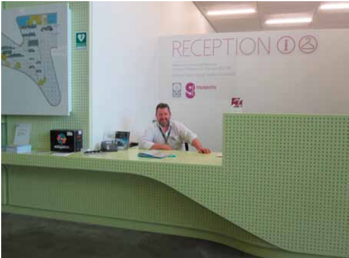
Riverside Enquiries Desk.

We have 8 wheelchairs available to borrow free of charge from the Enquiries Desk, subject to availability.