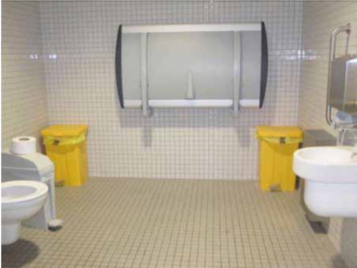
Large accessible toilet.

There is also an additional large accessible toilet on the ground floor which benefits from the same features as the standard accessible toilet with the addition of an adult changing bed. There is 1 baby changing toilet on the ground floor and 1 on the first floor. Both are within the accessible toilets.